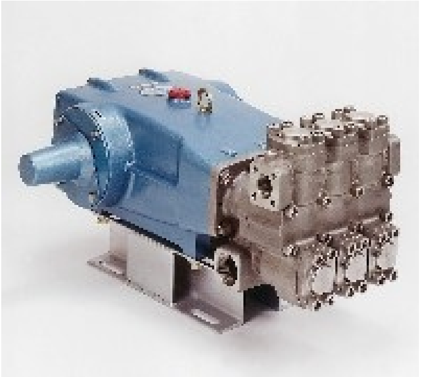
677160 FRAME PLUNGER PUMP