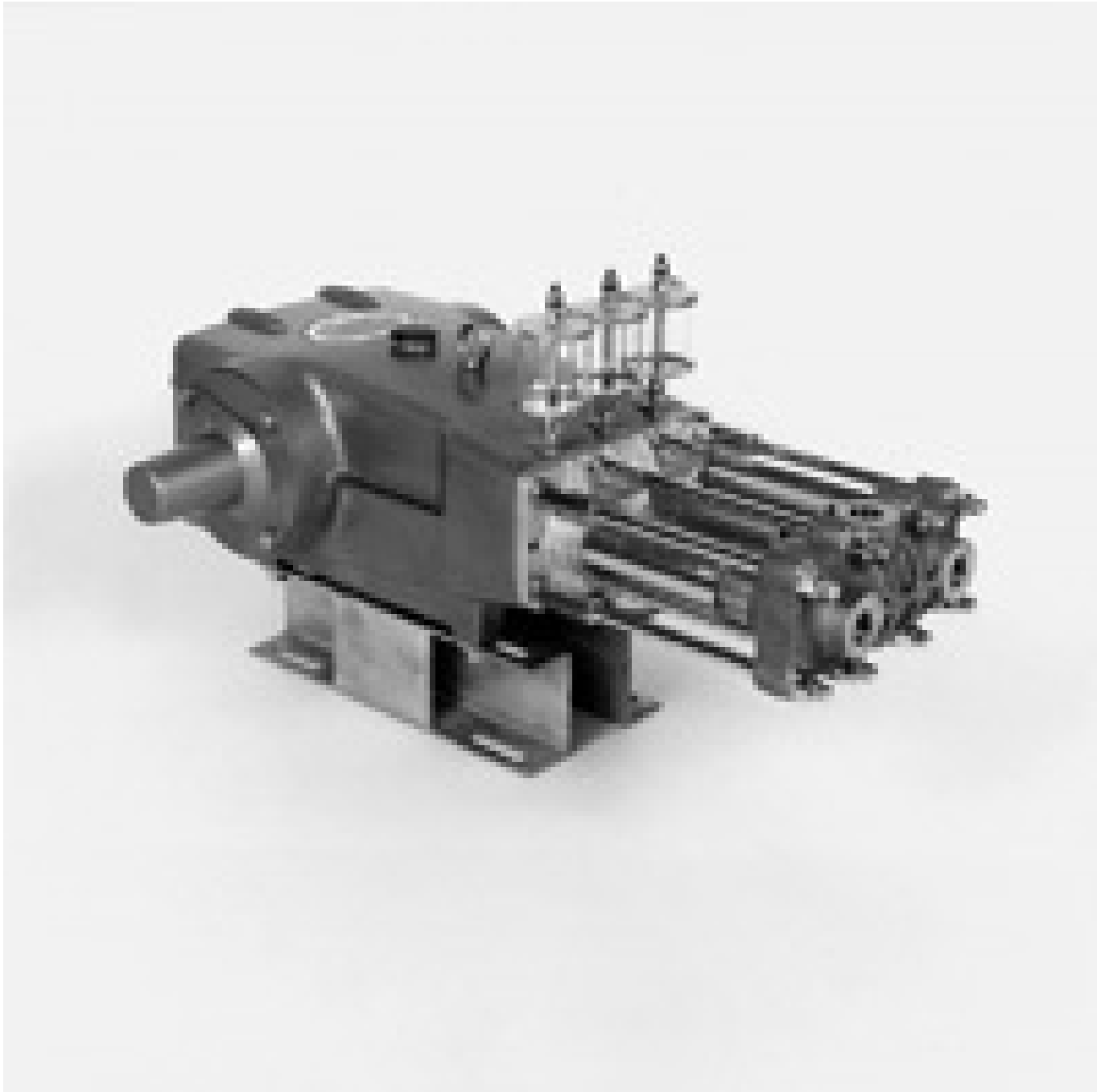
6024 OBSOLETE 60 FRAME PISTON PUMP