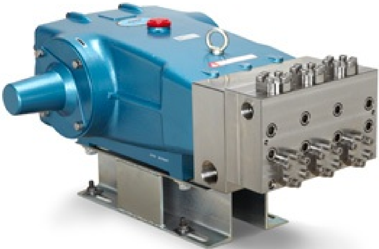
6835K68 FRAME BLOCK-STYLE PLUNGER PUMP