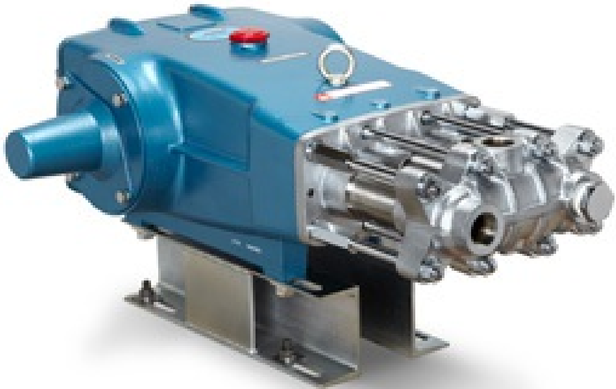
6020 60 FRAME PISTON PUMP