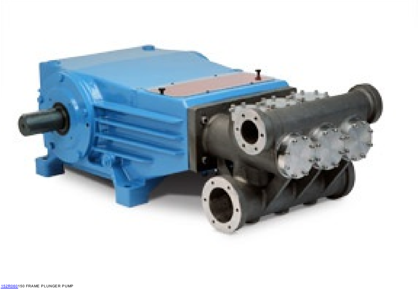
152R060 150 FRAME PLUNGER PUMP