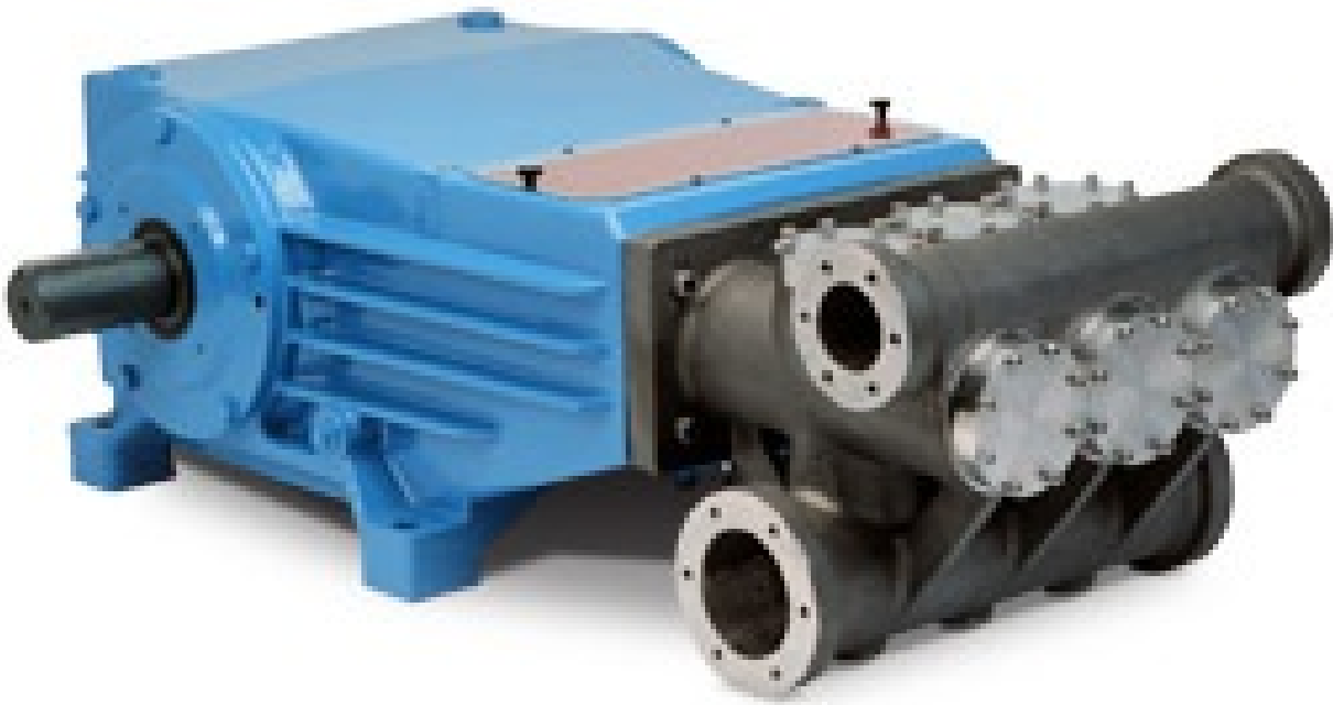
152R060C 150 FRAME PLUNGER PUMP