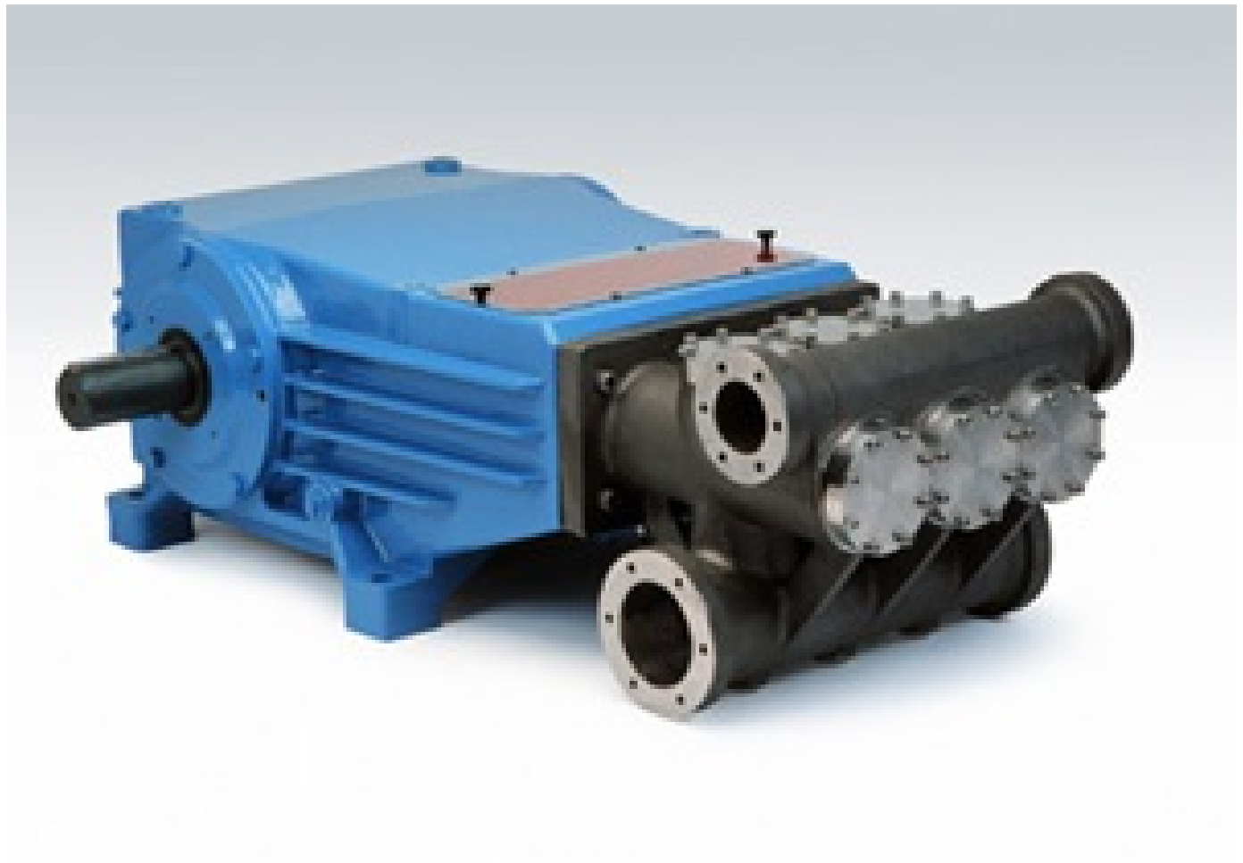
157R060 150 FRAME PLUNGER PUMP