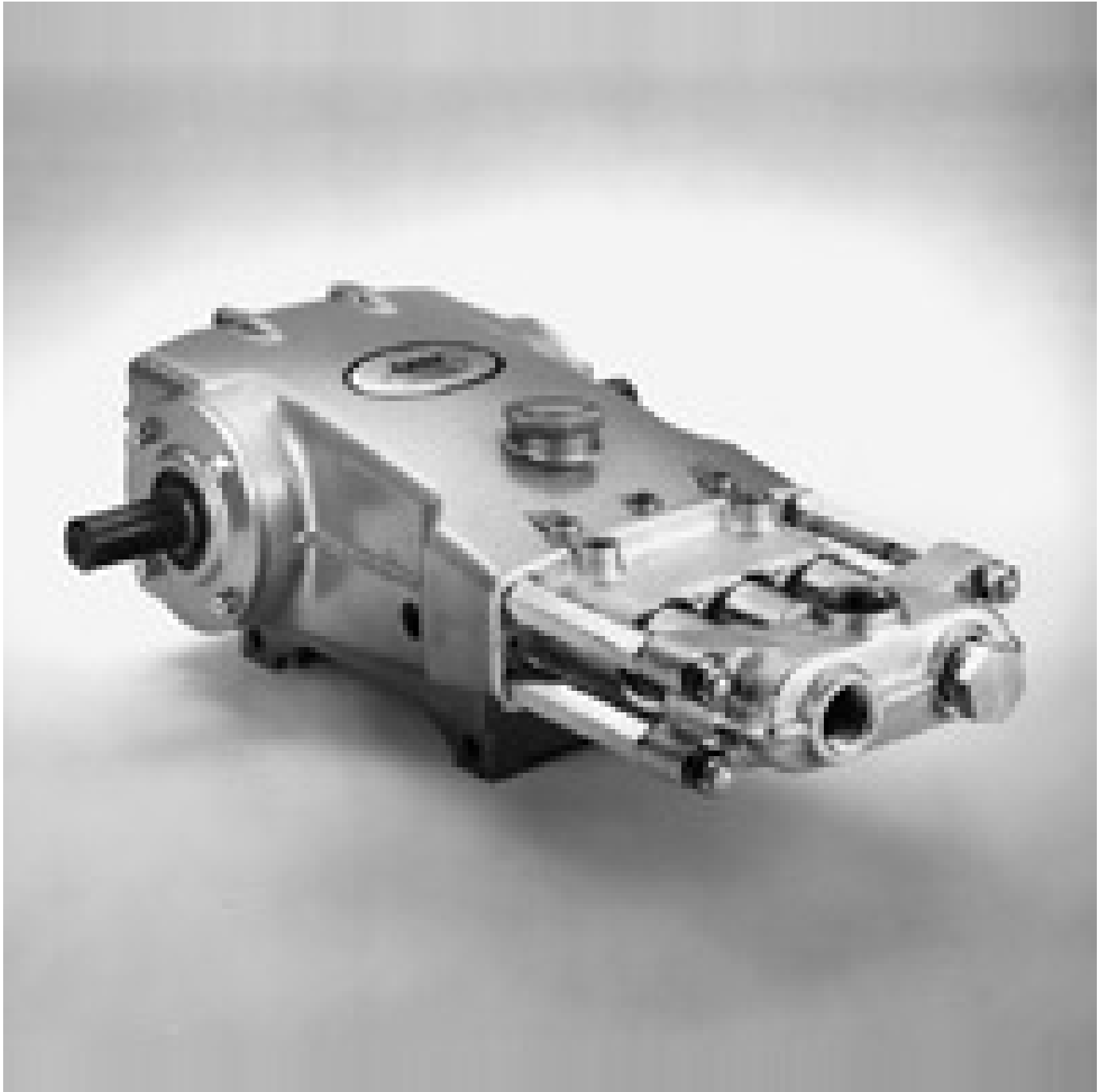
2520C25 FRAME PISTON PUMP