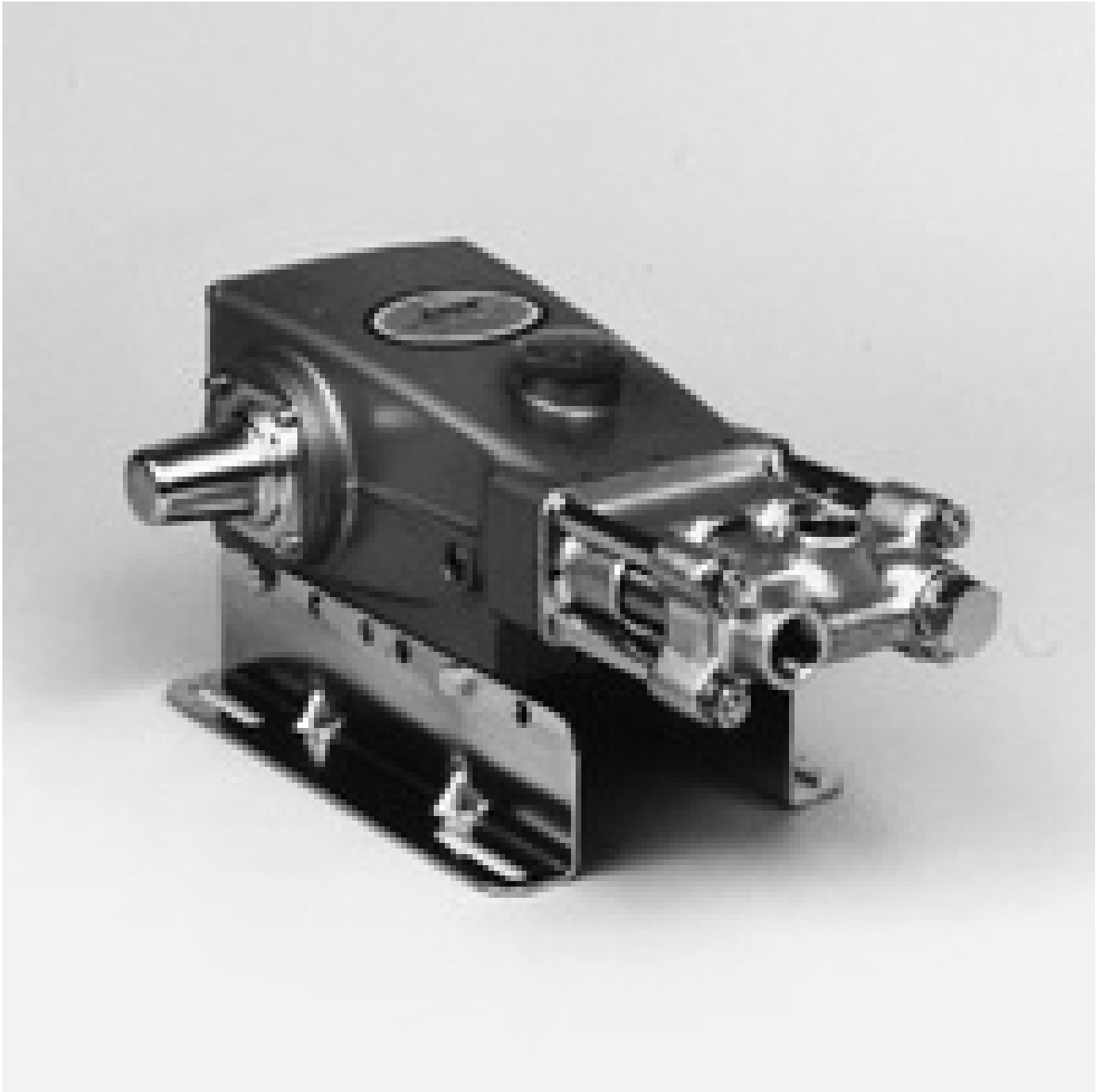
62110 FRAME PISTON PUMP