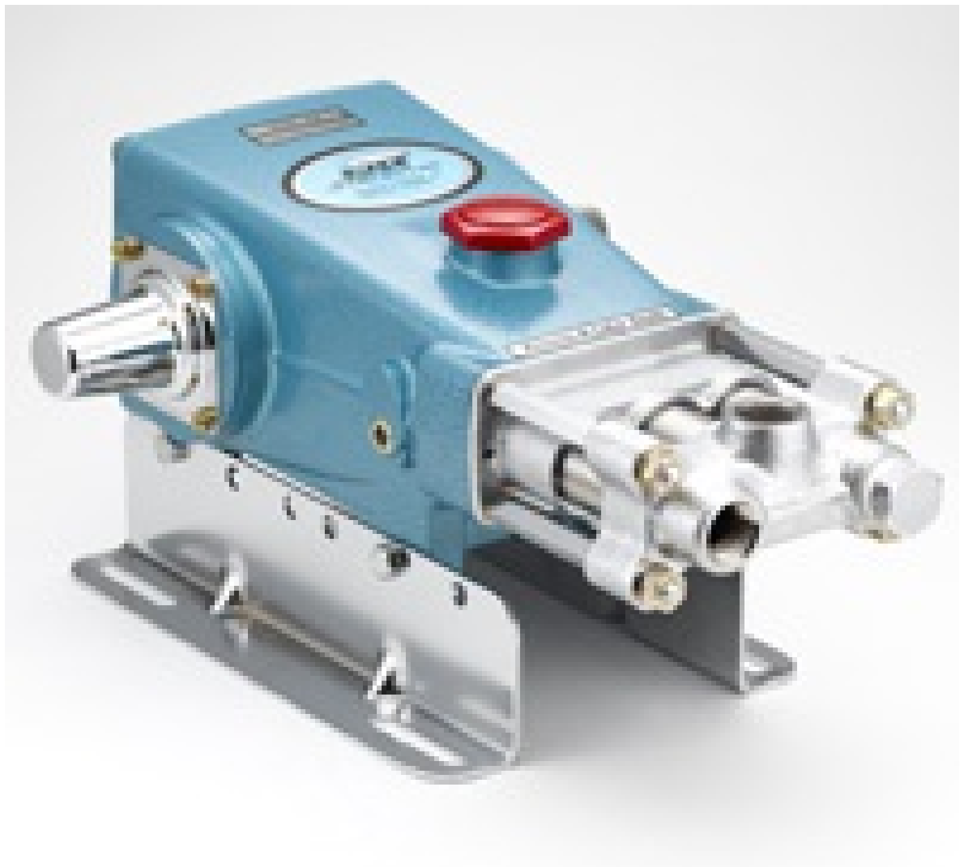
10110 FRAME PISTON PUMP