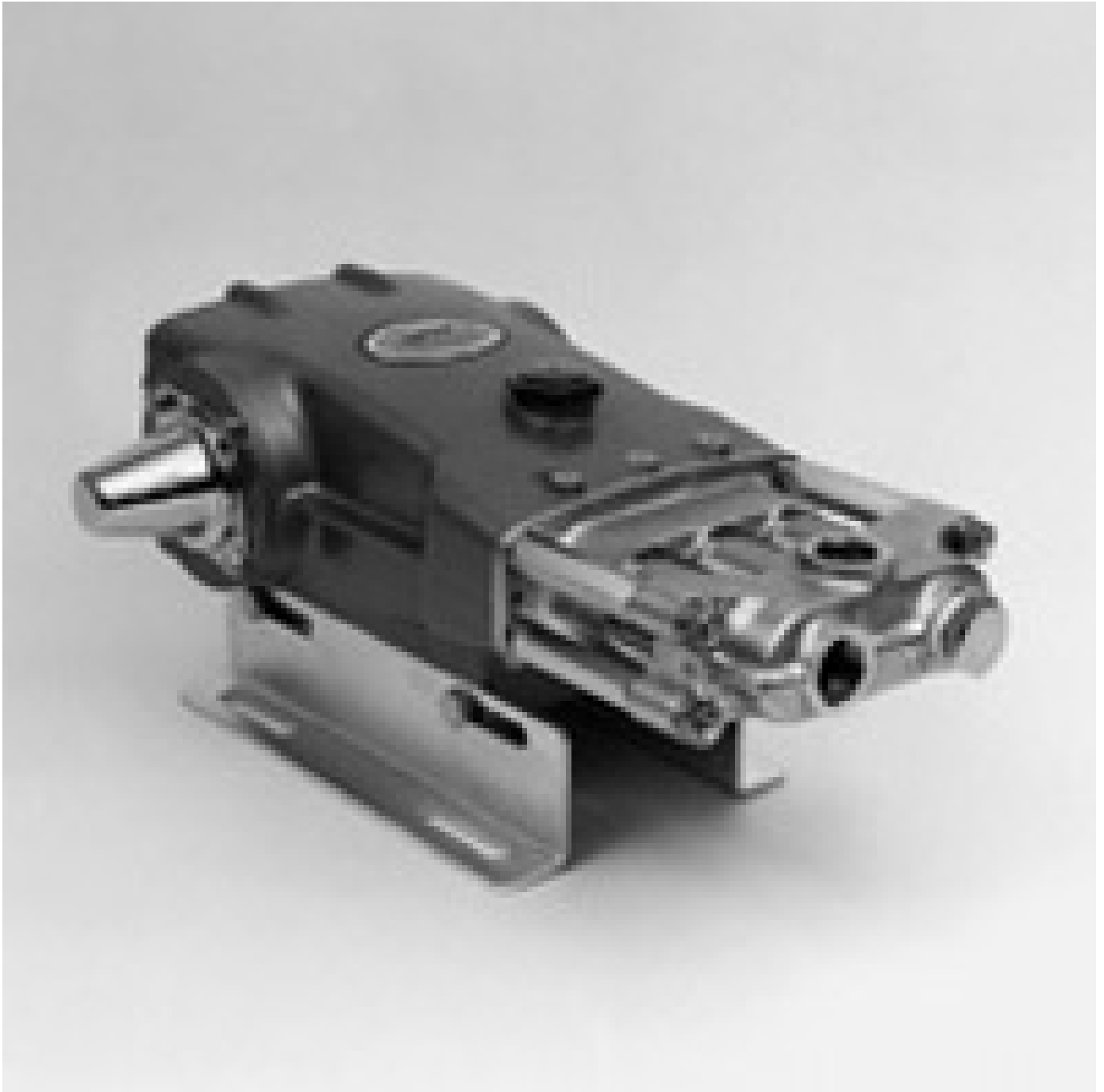
152125 FRAME PISTON PUMP