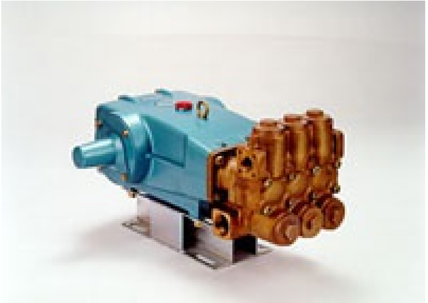
676760 FRAME PLUNGER PUMP