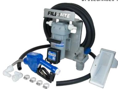
Automatic Nozzle DC System, RPV