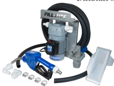
Automatic Nozzle AC System, RPV