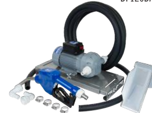
Drum Mount AC System, Auto Nozzle