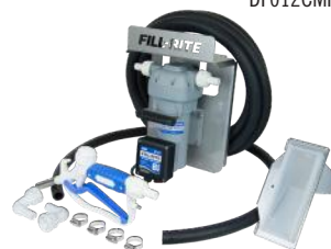
Manual Nozzle DC System