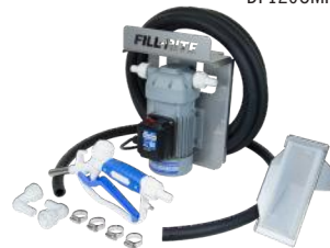
Manual Nozzle AC System