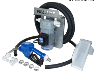
Automatic Nozzle AC System