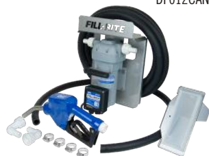
Automatic Nozzle DC System