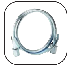
Powerlock Clamp PS (Pipe Size)

Most sizes available in lengths of 100 feet for rapid installations and lower labor costs