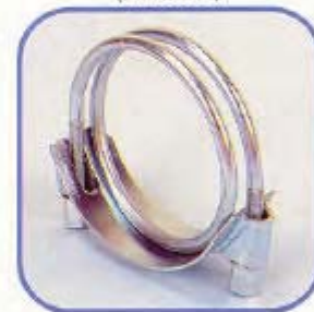
POWERLOCK CLAMP PS (PIPE SIZE)

Available in lengths of 100 ft. for rapid installation and lower labor costs.