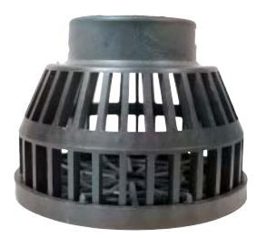
Polypropylene Strainer (NPSM Threads)