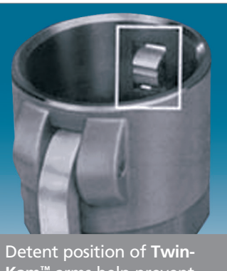
Detent position of Twin- Kam <sup>™</sup> arms help prevent unintentional arm release