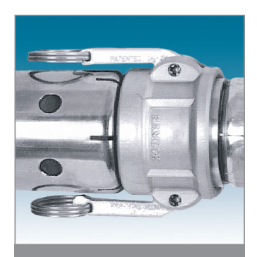
Spring-Ring <sup>™</sup> Finger Rings prevent rings from getting trapped under arms.